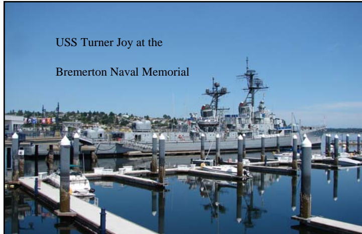
USS Turner Joy at the Bremerton Naval Memorial

Congress, dramatically increased the American combat presence in Vietnam.